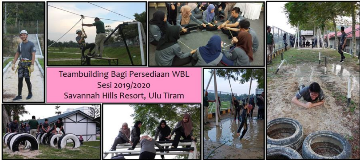
Teambuilding Bagi Persediaan WBL Sesi 2019/2020 Savannah Hills Resort, Ulu Tiram